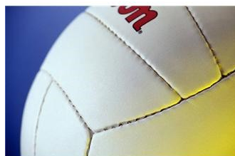
Volleyball—great exercise and lots of fun.

The group welcomes both new and experienced campers. If you are interested in joining the camping group for this adventure, please sign-up in the back of the sanctuary.