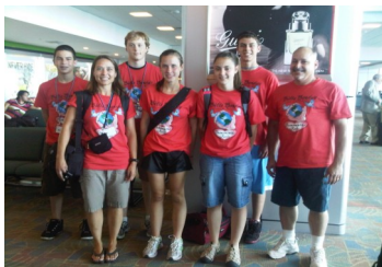
Trinity sent seven missionaries to Haiti this past July.

If you would like to learn more about the "Wholeness Wheel" from the ELCA, please log onto the ELCA website at www.elca.org and search for Wholeness Wheel.