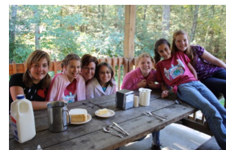
Alive, Alive at Nawakwa: a fun time for all Jr. High!

To register for this event, complete a form available at the youth bulletin board at Trinity or at our website. The cost is $95.00 per youth with an optional t-shirt available for $12.