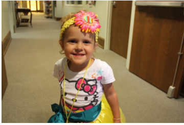
Fun had by all at VBS!