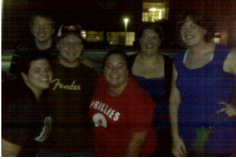
Trinity's Young Adults in Gettysburg.