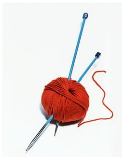
Hungry in Our Community Need Our Help!